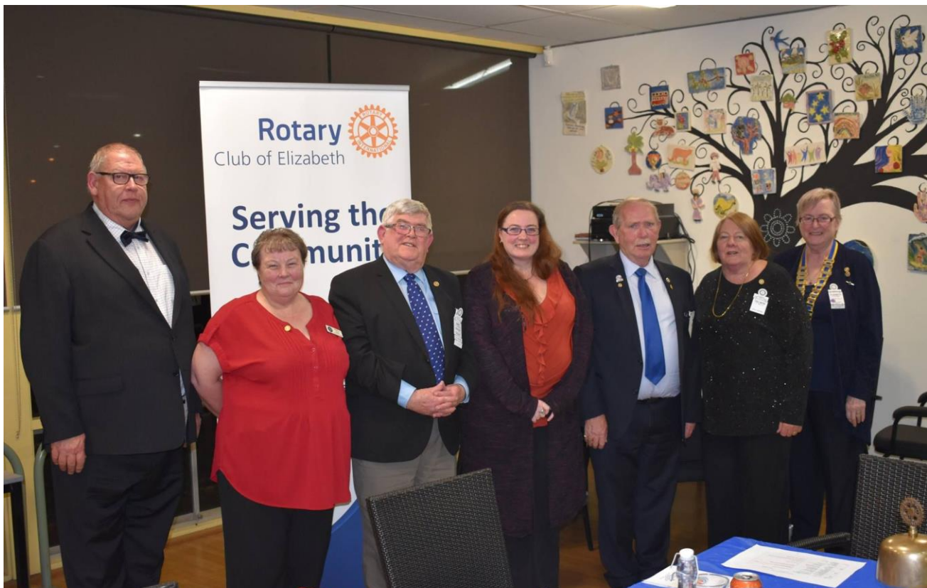
The 2018-2019 Board