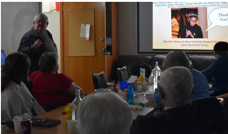
Members watching the presentations