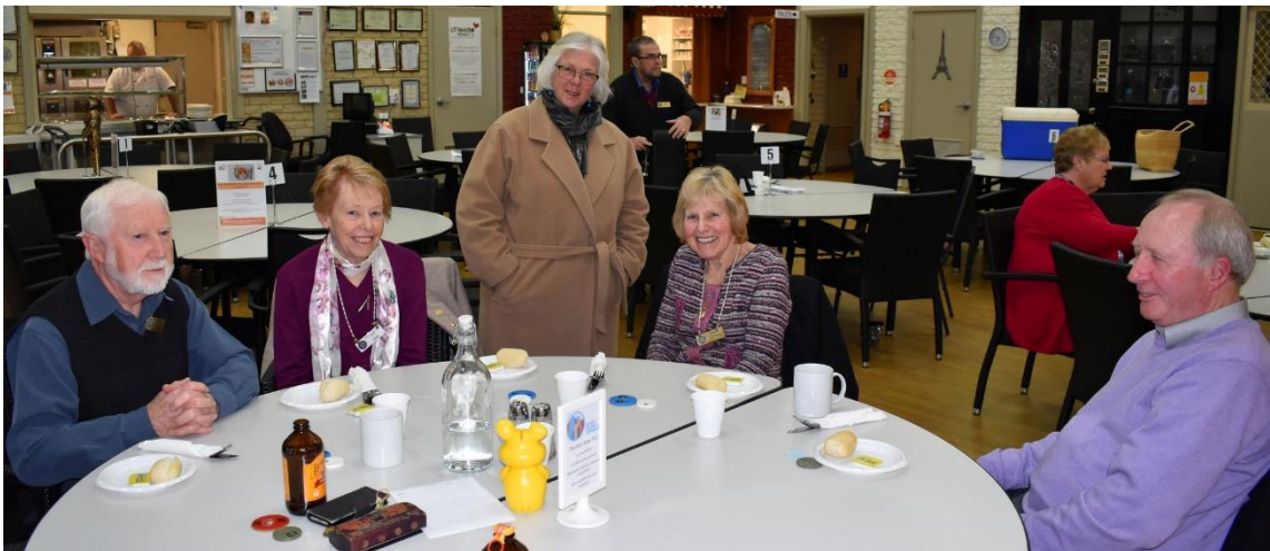
Rotarians from the Rotary Club of Playford

In Australia, farmers are the lifeblood of our country and they are in crisis . Record breaking heat and lack of rain means farmers are struggling to feed sheep and cattle, and keep crops alive. Families on the land are suffering and they need our help. Channel 9 and Rotary Australia have partnered with the National Farmers' Federation, launching an appeal to big business and everyday Australians, so we can provide some emergency relief.